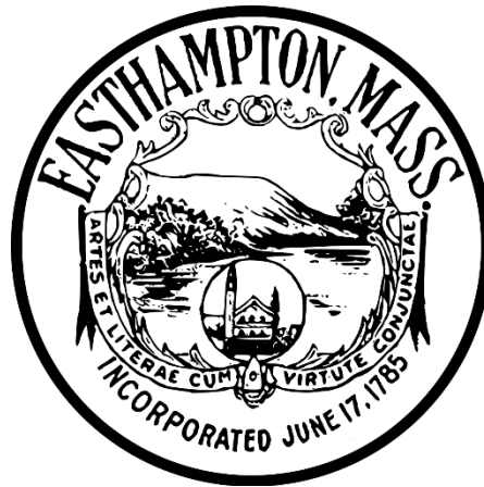
Exhibit I May 29, 2024